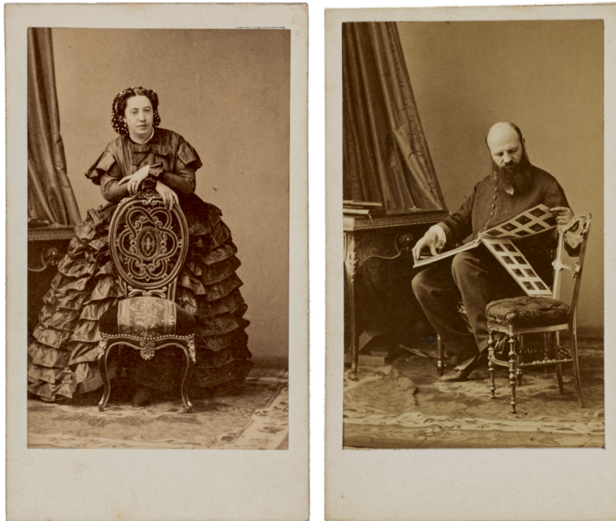
F1. Cartes de visite by Disdéri & Cie, c. 1860. 1. Portrait of M me Disdéri / Portrait of André Disdéri.

Until very recently, the photographer Geneviève Elisabeth Francart, Madame Disdéri (c.1818-1878), [F1.1] has been little more than a footnote in her husband's biography, André Adolphe Eugène Disdéri (1819-1889), [F1.2] the famous photographer who patented in November 1854 a system to lower the production costs of cartes de visite , the small albumen portraits mounted on cardboard (10.5 x 6.2 cm approx.) that revolutionised the photographic industry at the end of the same decade 1 .