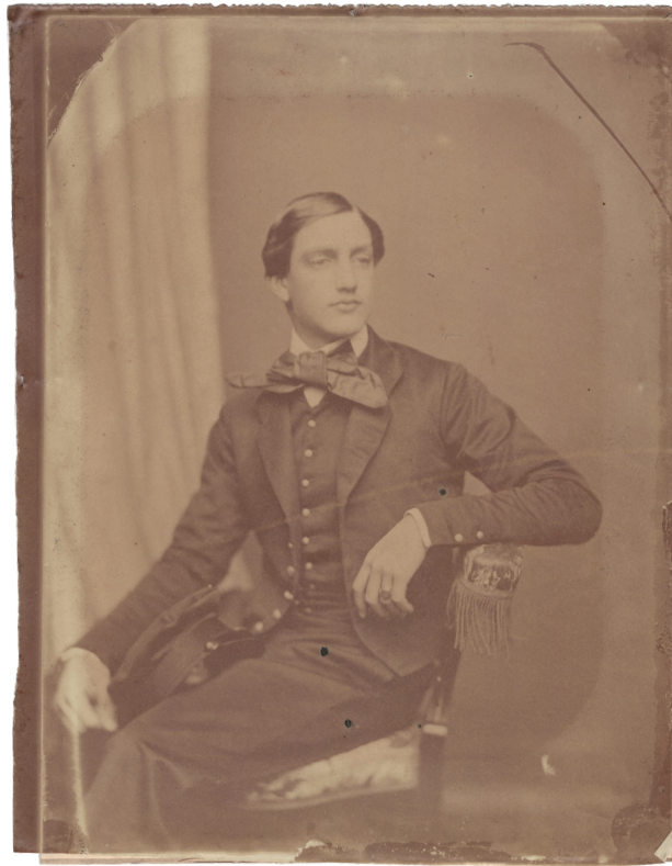
F4. Portrait of a Young Man , 55, Rue de Traverse, Brest, c. 1856-58. Salted paper by M me Disdéri, 24,3 x 19 cm. Author's collection.

her own: 'Photographie sans retouches / & Daguerréotype, / 53, Rue de Traerse [sic]. / M me . Disdéri / Brest.' 12 [F3.2 & F4]