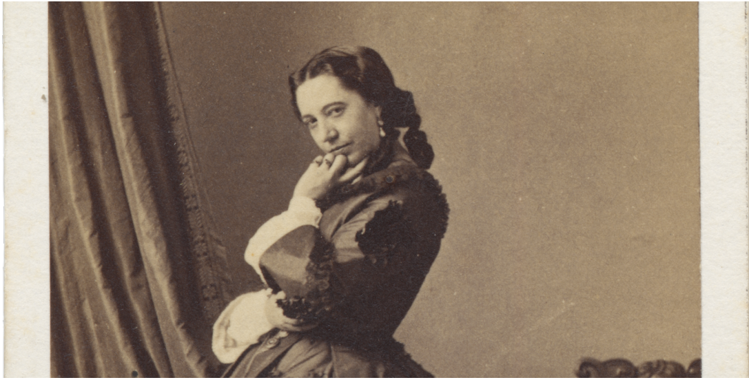
F9. Self-portrait by M me Disdéri (detail), Paris, 1858. Carte de visite by Disdéri & C ie . Author's collection.

obtain a good proof, nor will he be able to make women's costumes look their best or drape them appropriately. (This is exclusively a female domain) 46 .